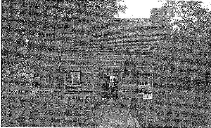
Proposed location of plaque inside the fence