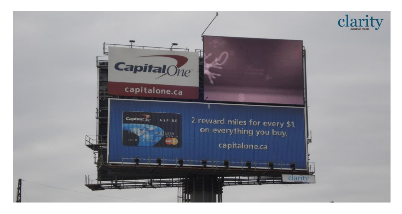
East facing after changes