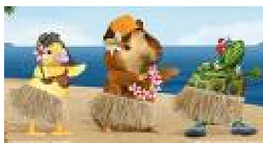
The Wonder Pets

The popular Ni-Hao, Kai-lan* , a young girl comes to the CNE this year to share her biculturalism (speaking both English and Mandarin Chinese ) in her playtime adventures with her animal friends with singing and dancing throughout the show. As seen on Treehouse TV!