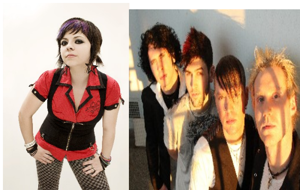
Shiloh & Faber Drive

Canadian music artist Fefe Dobson returns to the CNE along with the Canadian pop punk band The Latency who fuse underground edge with mainstream melodies, joining Shiloh and Faber Drive at the Bandshell on the fair's second Sunday.