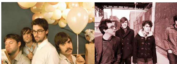
Winter Gloves and Tokyo Police Club

The CNE's second Saturday sees two more Canadian indie bands making their CNE debuts at the Bandshell: Winter Gloves and Tokyo Police Club .