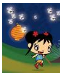
Ni Hao, Kai-lan

Monday, August 24 th and 31 st , Kids World Park Times (To be Confirmed)