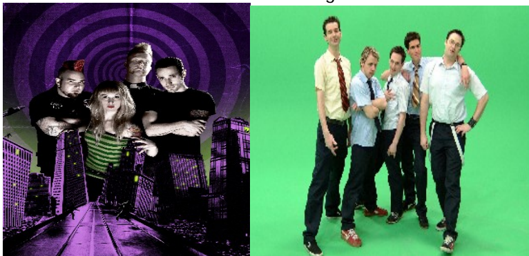
The Creepshow & The Planet Smashers

Summon your inner demons and head to the CNE Bandshell for a fiendish Friday night of horrorbilly and ska punk featuring two hot Canadian indie bands: The Creepshow and The Planet Smashers .