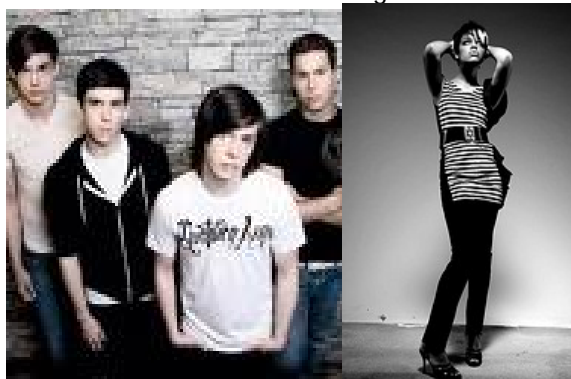
The Latency & Fefe Dobson