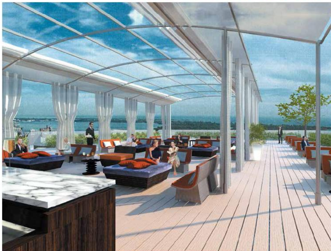
Roof of Grand Ballroom

The Ballroom and Hospitality Level includes 32,600 square feet designated for ballrooms, furnished prefunction spaces, refreshment break, kitchen and service areas, and features access to 6,800 square feet of outdoor terraces and balconies. Each ballroom has been designed with rich materials and color changing LED lighting, which can instantly transform the mood and functionality of the spaces to the unique needs and desires of each event planner. Outdoor events can be staged on the roof which provides an additional 6,700 square feet of event space ideal for spring and summer gatherings. The space can also be tented to offer a year round option.