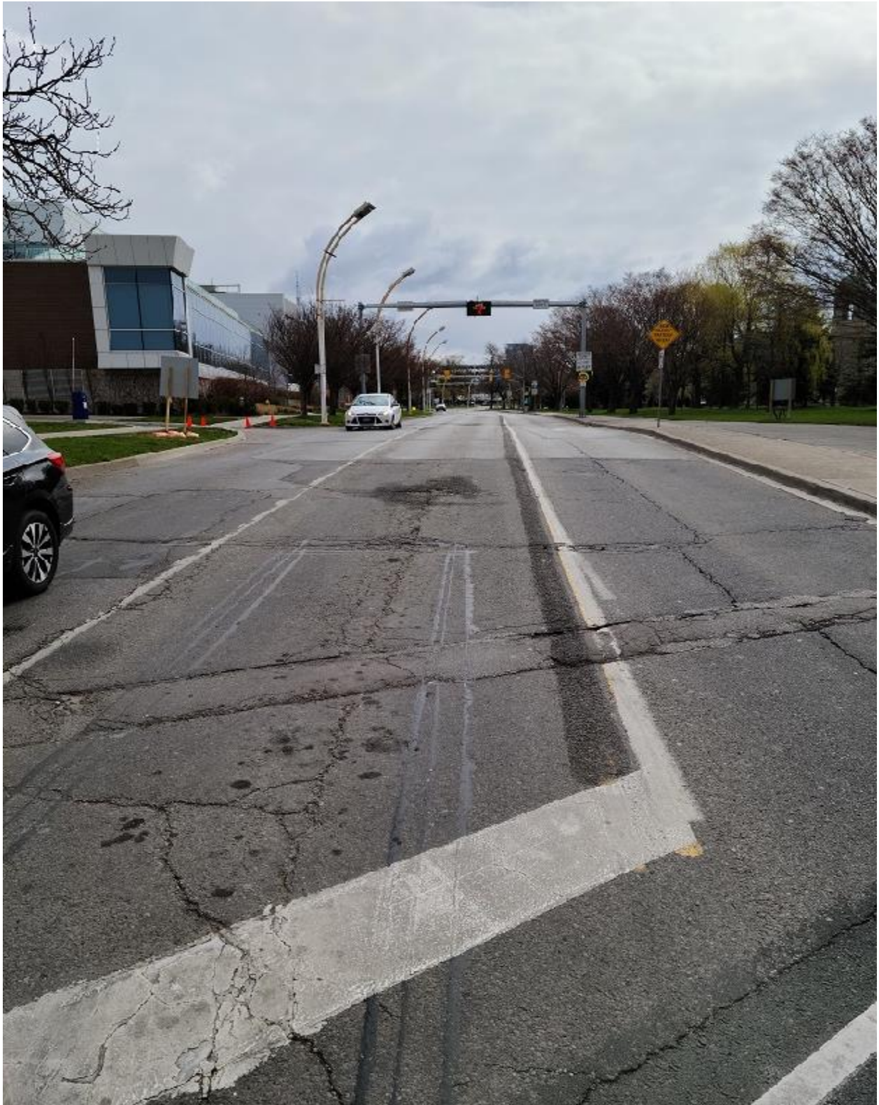
Picture #1: British Columbia Road and Lake Shore Boulevard (facing east)